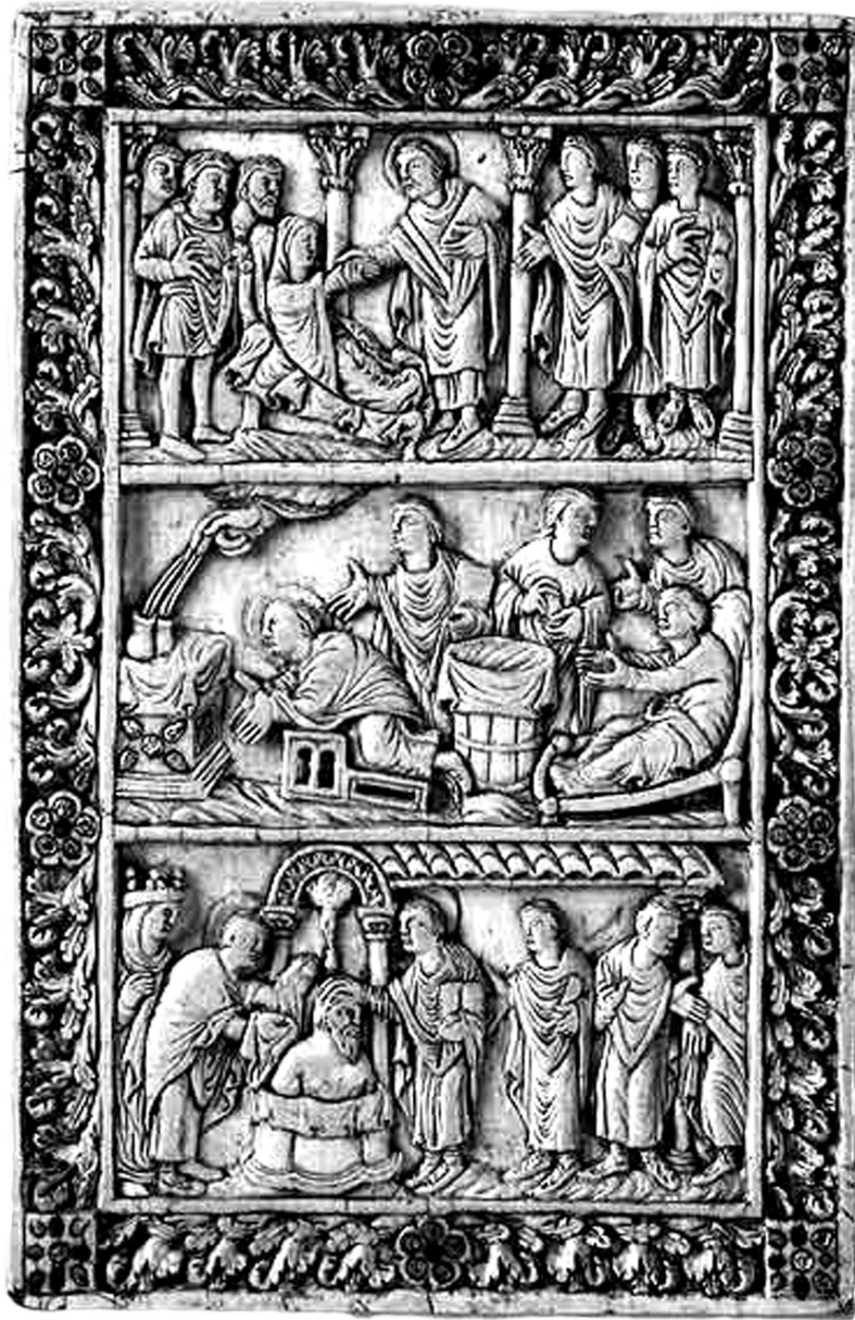
a 9th C. relief depicting the baptism of Clovis I at Rheims in 500 A.D.